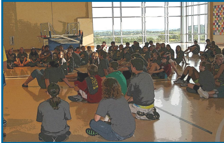
Lawrence 1st West Campus was a wonderful location for the 4th annual event.